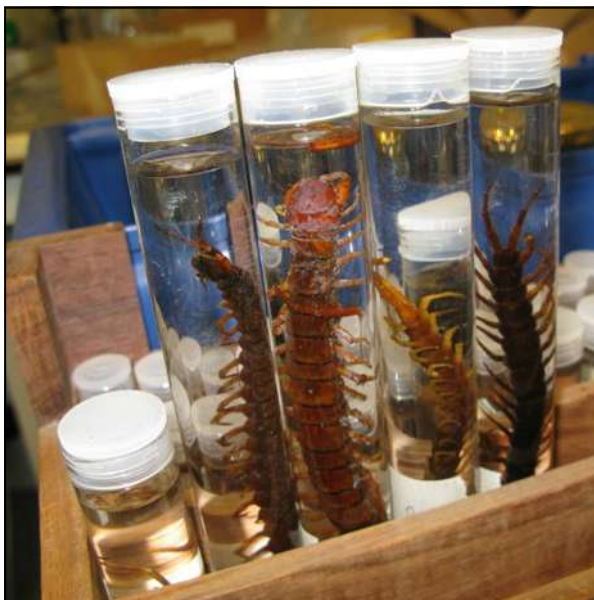
Fig. 5. Centipede specimens immersed in the test wetting agent solutions.