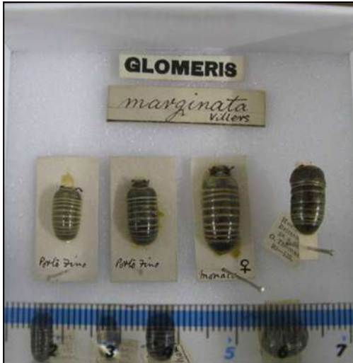
Fig. 3. Diplopoda (millipedes) – Glomeris marginata (Villers, 1789).