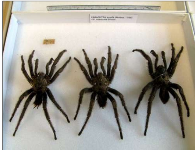
Fig. 4. Araneae (Theraphosidae) – Paraphysa scrofa (Molina, 1788).