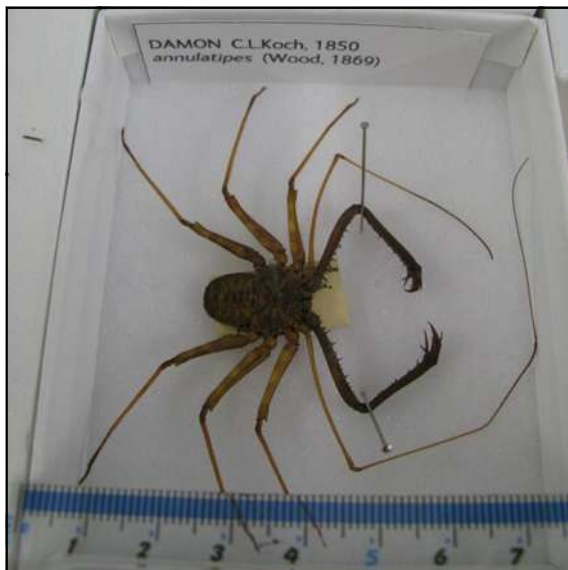
Fig. 1. Amblypygi (whip spiders) – Damon annulatipes (Wood, 1869).

A 2% solution of Decon 90 was used, as this was found to be the more effective strength by Beccaloni (2001). Five grams of TSP in 1L distilled water, with 5ml of Agepon was used, as this solution strength was recommended by Jocque (2008) and Nellist (2009). The specimens were fully immersed in the test chemicals in tubes or small jars (Fig. 5). Beccaloni (2001) recorded results after 17 hours immersion in the test chemicals. This approach was not ideal because several specimens did not successfully hydrate and Nellist (2009) found that successful hydration in A&TSP occurred after an immersion time of between 10 and 15 days. It was therefore decided to monitor the specimens, and remove them once they had sunk in the test chemical, which would indicate successful hydration. The deterioration of specimens is considered totally undesirable, so where specimens began to deteriorate, even when they were still floating in the wetting agent solution, they were removed. The specimens were then thoroughly washed in distilled water and transferred into 80% IMS. This resulted in various immersion times between 5.5 and 16 days.