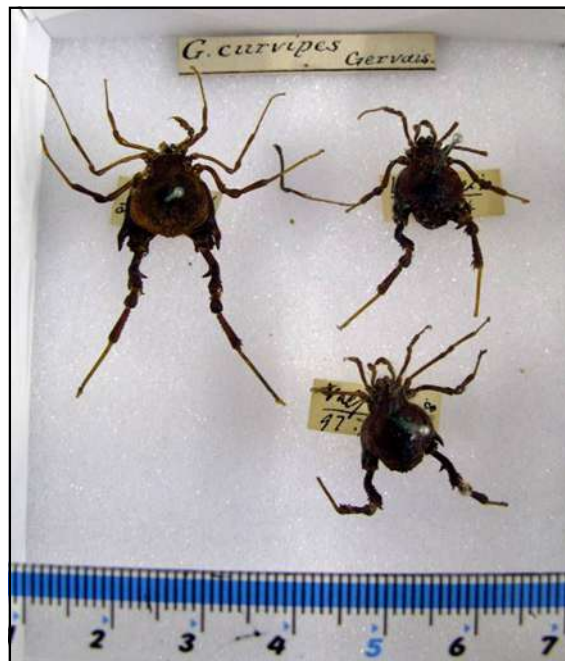
Fig. 2. Opiliones (harvestmen) – Pachylus chilensis (Guer.-Men.).